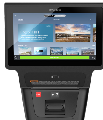
P84 16" Touchscreen (Single Paddle Option)