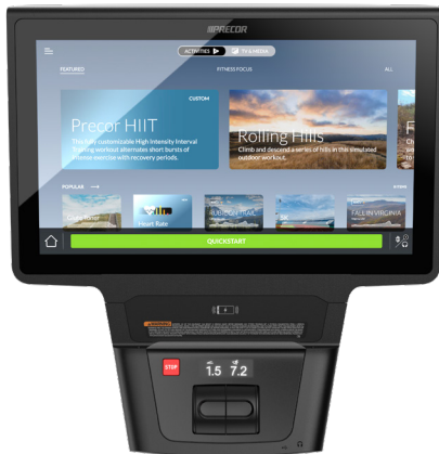
P94 22" Touchscreen (Dual Paddle Option)